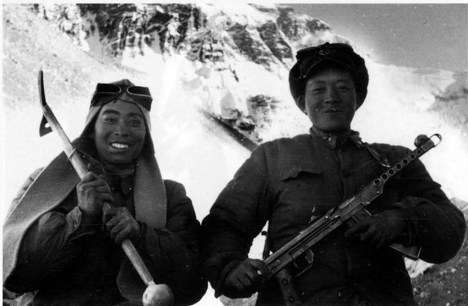
36. Two soldiers from Sichuan province who carried their sacks and automatic guns to the highest point reached. They are seen near Camp II, c 5300m, on 18.11.1958. (p109)

Members of the Russian party were dressed in high fur-lined boots, down clothing with windproof anorak and trousers over it. The huge three-cornered fox fur hat was issued by the Chinese as part of the officers' winter uniform of the People's Liberation Army. (p109)