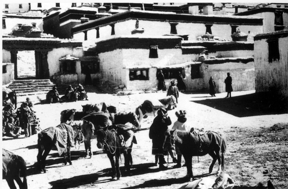
38. The Rongbuk monastery was later destroyed in the so-called 'cultural revolution'. It was possible to ride a horse through the main entrance on the left. At the top of the picture are the premises where the party stayed overnight on their way back from the reconnaissance. ( Lev Filimonov ) (p109)