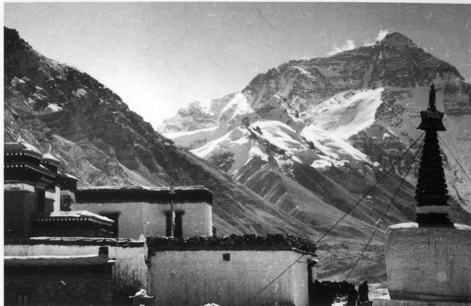
37. The Rongbuk monastery, reached by the party on 16.11.1958, and the North Face of Mount Everest, with Changtse, 7550m, in front of it and Peak 6882m on the left. (p109)